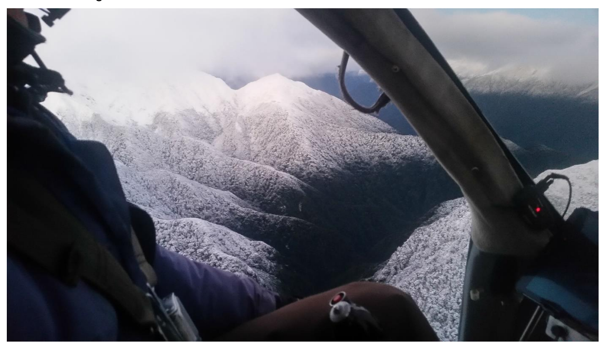
Main Range June 3rd 2019