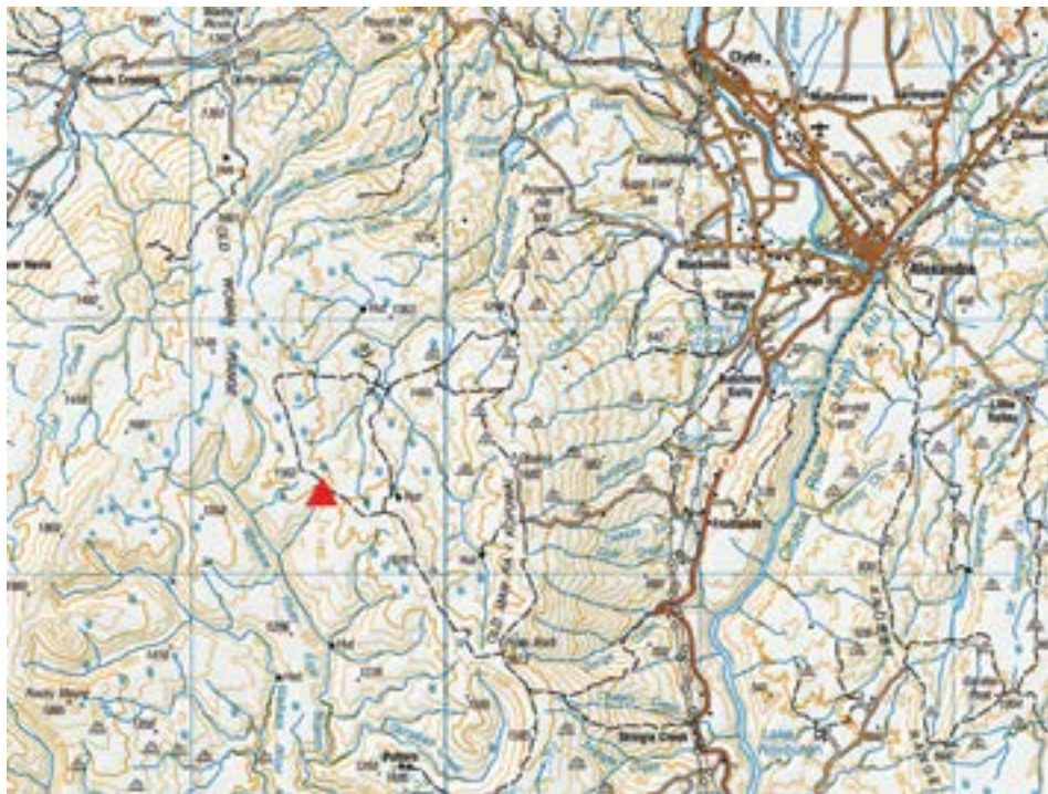
The red triangle shows the approximate location of the aircraft. Contains data sourced from the LINZ Data Service licensed for reuse under CC BY 4.0.

more than three hours searching in appalling conditions, some of the team stood down. The remaining members of the search team relocated in one vehicle to the western end of the search area waiting for a clearance in the cloud so that a night-capable helicopter could assist. As they waited, they continued to make short forays from the vehicle to probe the surrounding area. At about 3.30am, during one of these trips, the wreckage of the aircraft was located approximately 300 metres from the search vehicle. Unfortunately, the appearance of the aircraft indicated that the crash was unsurvivable. At this stage, because the incident was no longer classified as a 'search', the Rescue Coordination Centre New Zealand closed it, and handed over to Police for scene examination and body recovery.