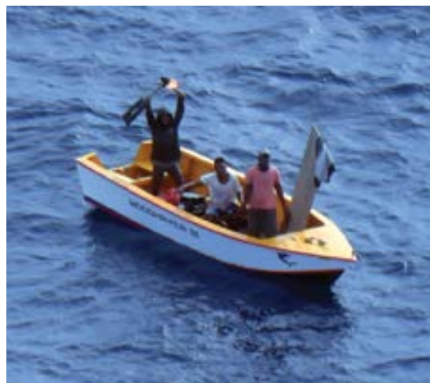
Missing fishing vessel Woodhaven III.

The crew dropped survival kits with water, chocolate and locator beacons to those on board.