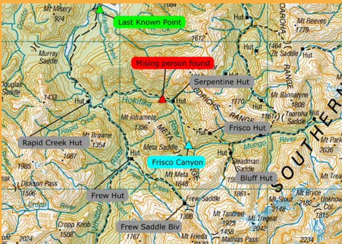
Operational area map. Contains data sourced from the LINZ Data Service licensed for reuse under CC BY 4.0

VHF radios provided some connectivity between nearby teams during the day. InReach satellite notification devices were used, but less effective due to the time delay in sending and receiving messages.