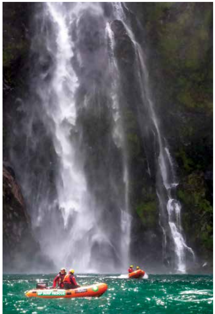
The Surf Life Saving NZ Otago SAR Team testing their remote deployment capabilities in Fiordland National Park.