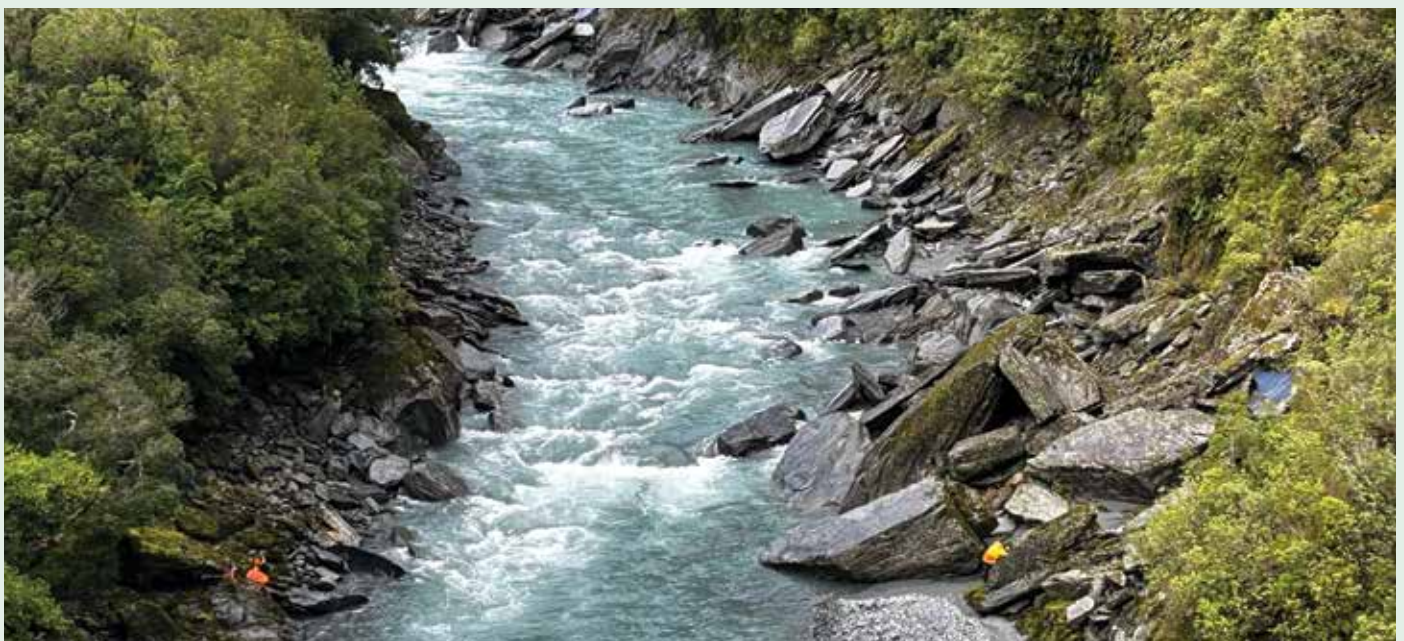
Search teams locate the missing man on the true left bank of the Hokitika River.