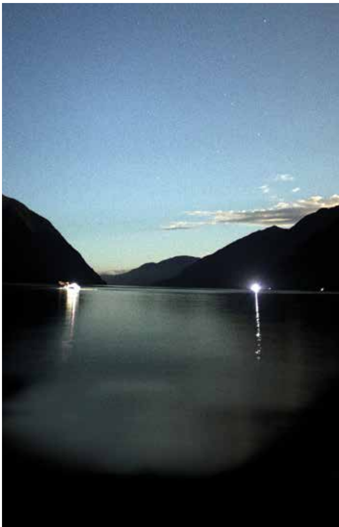
Night exercises on Lake McKerrow.