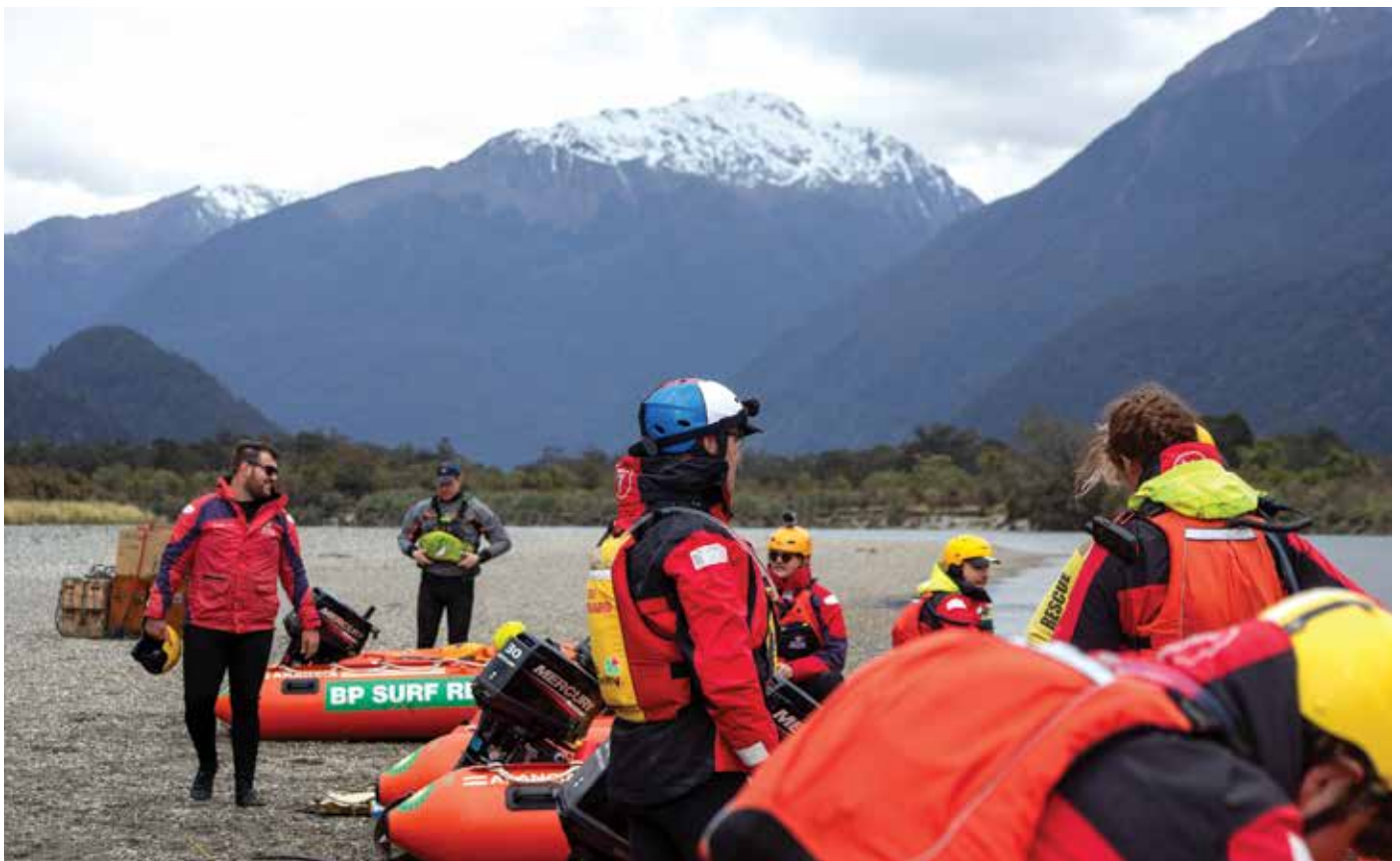
Assembling the IRBs on the shores of Lake Alabaster.