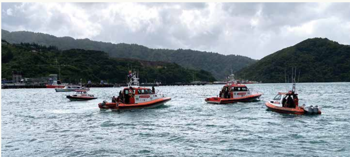
Coastguard Rescue Vessels from units in Nelson, South Taranaki, Kaikoura, and Marlborough heading out to begin a multi-vessel search during the Marlborough Sounds Regional training exercise.