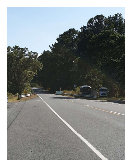
HATFIELDS BEACH & BRIDGE